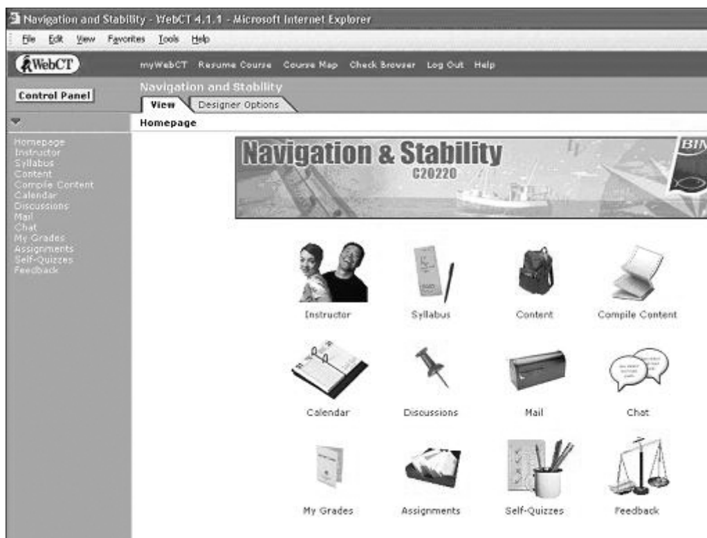
Figure 3. The Navigation and Stability WebCT course front page.

“This research and conversations with students and faculty suggest that the more interactions the better. As an administrator of a fairly large online programme [ 7500 student enrolments in 2004 academic year], I never have received a student complaint which states there was too much communication.” Students expect interaction to occur in distance education with the advancements in technologies. They