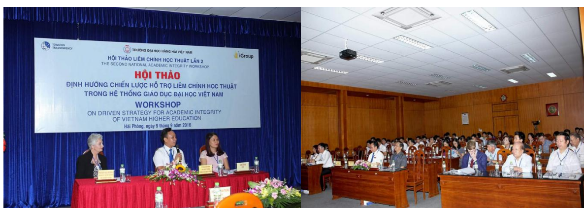
Figure 5. The second national Academic Integrity workshop organized at VMU

After one and a half year application of Turnitin software for originality checking at VMU, the University has summarized building process of Academic Integrity and organized successfully The Second National Academic Integrity Workshop in 2016 (Figure 5). Through this workshop, the university has passed our experienced to other universities as well as getting experiences from other universities in Vietnam and foreign universities such as National Economic University, RMIT University, British University..., the University has been modified and completed procedures for Academic Integrity corresponding to our real conditions.