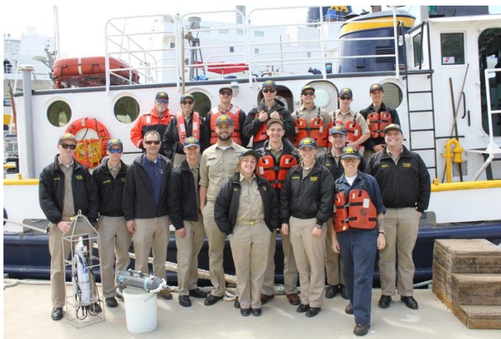
Figure 1. Photograph of student and faculty participants in front of the training vessel M/V Cub , April 2017.

We predicted that the exposure of students to marine science research would improve their “ocean literacy.” Ocean literacy is defined as 1) an understanding of the essential principles and fundamental concepts about the ocean; 2) the ability to communicate about the ocean in a meaningful way; and 3) the ability to make informed and responsible decisions regarding the ocean