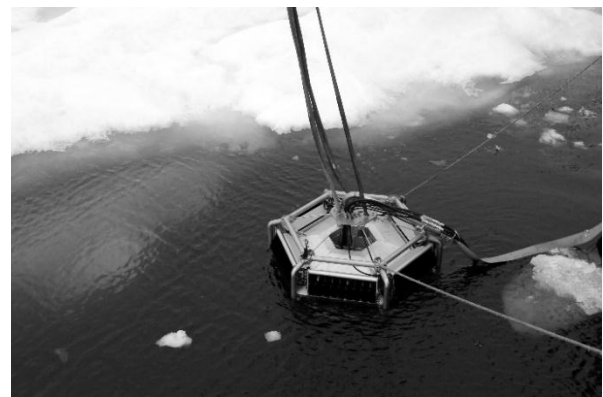
Figure 2 An oil skimmer

There is some additional challenges in mechanical recovery in ice-covered waters versus to open waters. When the ice coverage go beyond 10 -20%, it is difficult to operate with booms while the ice itself can act as a boom to border the oil. In icy waters, skimmer needs to be capable of deflecting the ice to reach the approach to the oil. (Sørstrøm, et al., 2010)