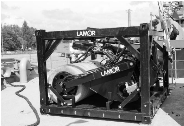
Figure 1 Brush bucket skimmer (Lamor)

When oil is trapped under drifting ice floes, mechanical recovery is a significantly demanding case. At the moment, there are no proven technologies or techniques for managing with scenario where there would be medium or large spill involved. In addition, there is still lack of technological inventions to position and track the oil from icy waters (new sensors are under development but not yet functional). (Council, Arctic, 2015) The developed arctic skimmers (Figure 2) are able to process larger numbers of a cold oil and ice mixture. The heating of critical systems is important to prevent freezing. In addition, oil pumping equipment and techniques have been developed to be suitable for cold conditions. (Tammiala, 2017)