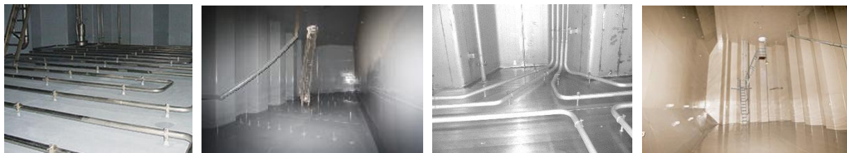
Figure 1. Tank coatings; epoxy (a), zinc silicates (b), stainless steel (c), MarineLine (d).