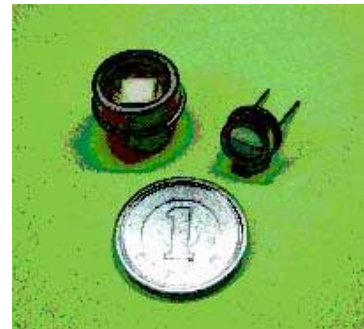
Fig. 2 Small sensors (The coin is 2cm in diameter)